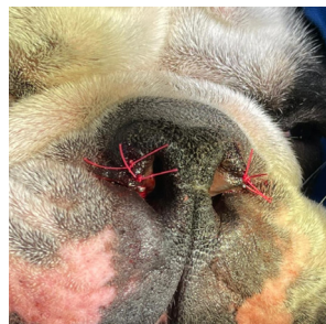
Post surgery laser treatment for incision wounds accelerates tissue repair and more complete healing.