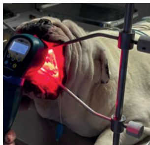
Post surgical laser treatment for swelling and inflammation improves airways, helps (open) faster.