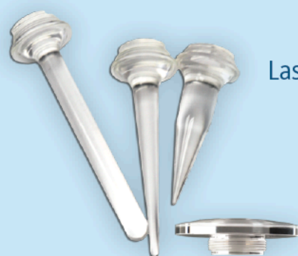
LaserPuncture Trigger Point Probes