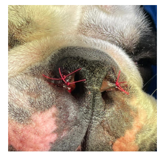
Post surgery laser treatment for incision wounds accelerates tissue repair and more complete healing.