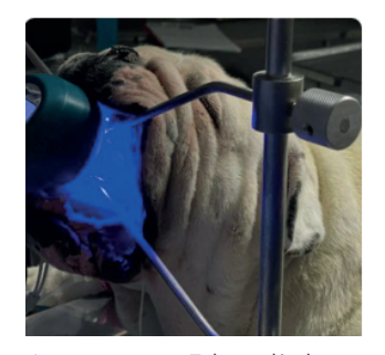
Interop - Blue light fights infection by its anti-microbial and anti-inflammatory effects.