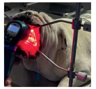
Post surgical laser treatment for treatment swelling and wounds inflammation tissue reimproves airways, helps (open) faster. Post surface treatment for treatment wounds wounds inflammation tissue reimproves airways, helps (open) faster.