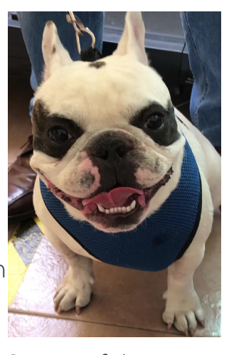
Successful outcome - better quality of life.